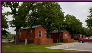
Grapevine, TX On Lake Grapevine