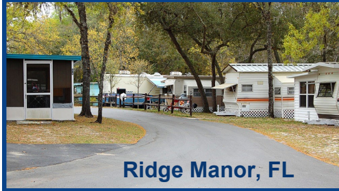
Ridge Manor, FL