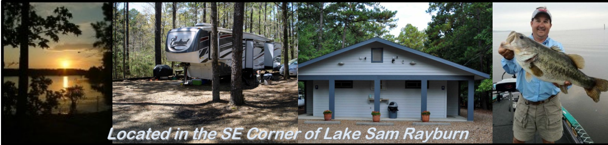
Located in the SE Corner of Lake Sam Rayburn