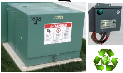
One transformer operates multiple pedestals feeding 10 RV sites, 6 cabins and sewer pump.

The Peak Energy Saver installs at each transformer (after the meter) with a dedicated 2 pole 15 amp breaker. As a result, the Peak Energy Saver runs in parallel with everything connected to that transformer and any sub-panels downline from the transformer.