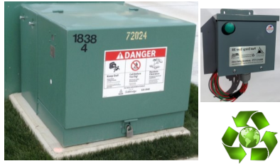
One transformer feeds Office, camp store pool, clubhouse, hot tub laundry and bathhouse.