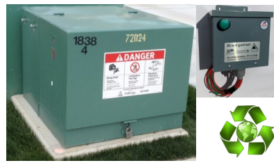
One transformer feeds 8 RV Sites, 5 park homes and water fountain.